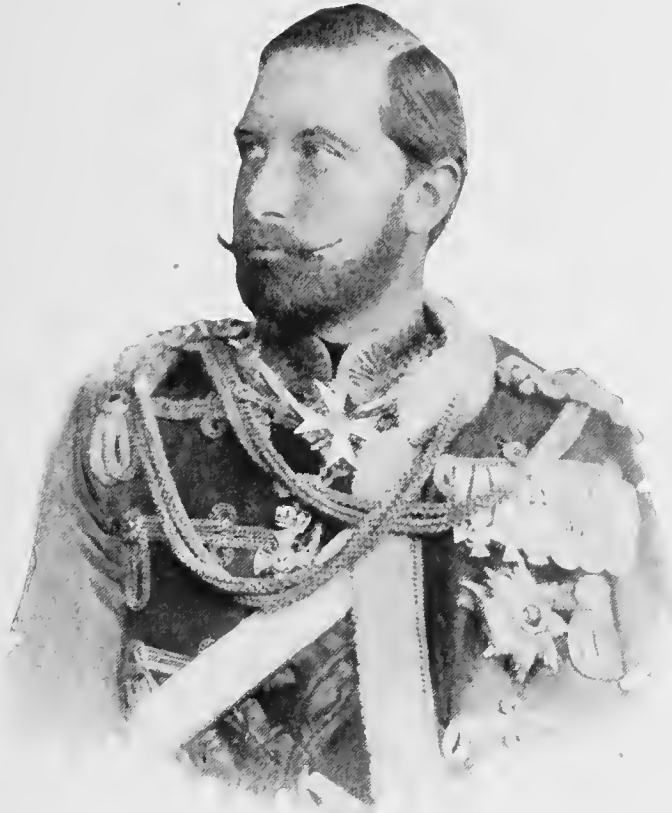
A SUPPRESSED PHOTOGRAPH OF THE KAISER TAKEN WHEN HE WAS EXPERIMENTING WITH A BEARD